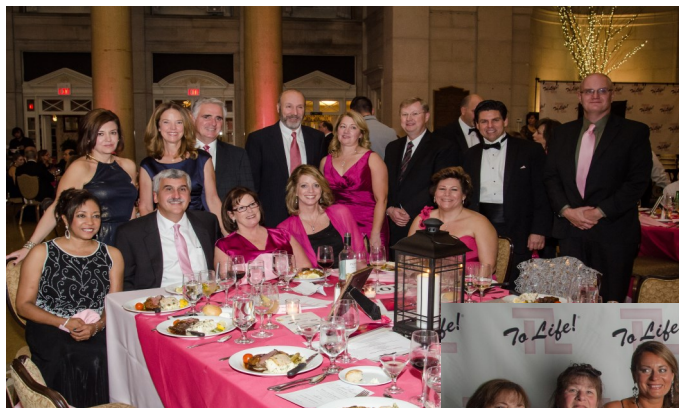
Saratoga Hospital staff and friends attend The Pink Ball, on October 17, 2014.

group of survivors/thrivers meet at the hospital, providing friendship, support, knowledge and hugs for all.