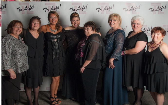
Members of the Saratoga Support Group attend The Pink Ball, on October 17, 2014.